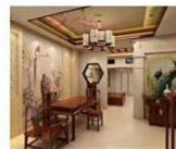
Building materials industry